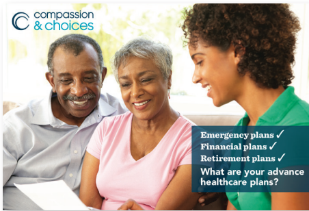
C&C's General Outreach Card

Do you live in a state where end-of-life options aren't getting the attention they deserve? Or do you live in a state where there is an active campaign to pass a medical aid-in-dying law? Or are you fortunate enough to live in a state where medical aid in dying is already authorized, where we are focusing on the important work of ensuring people know about and have access