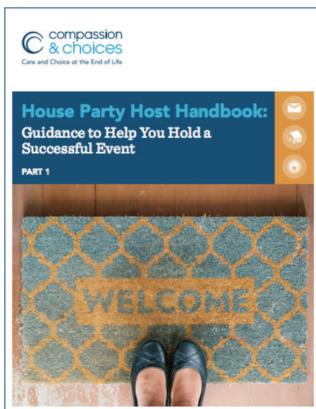
The House Party Host Handbook

One of the most effective things we can do right now is expand our volunteer base across the country. If you live in a state where there aren't any Action Teams, consider stepping