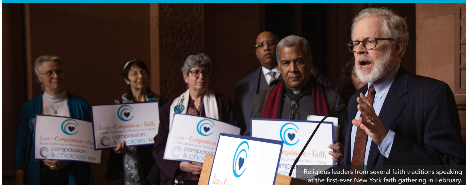
Religious leaders from several faith traditions speaking at the first-ever New York faith gathering in February.