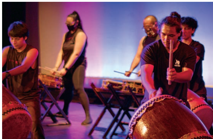
left: Annual APAICS Awards Gala. right: Taiko drums musical performance at the 2023 Hawai'i Arts Summit.